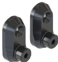
Boom 25 mm