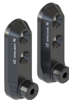
Boom 30/50 mm