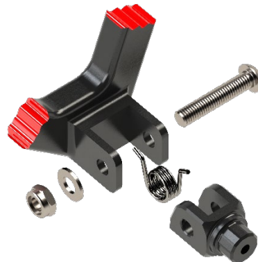
Exemplary assembly illustration

Screws must always be secured against self-loosening.